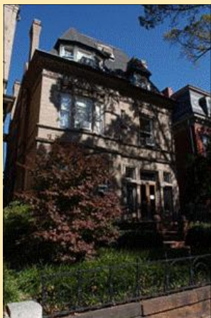
Thurston House, 808 W. Franklin St.