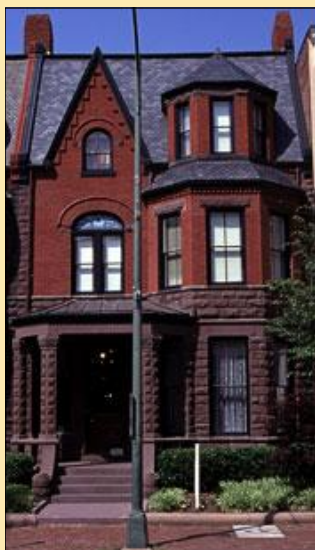
Richard T. Robertson Alumni House